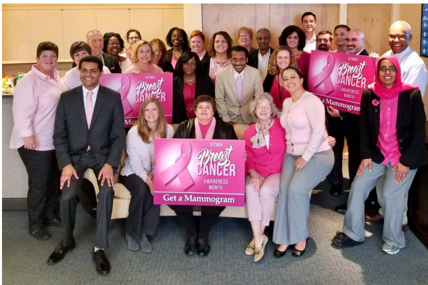
Department of Health senior staff members wore pink in acknowledgement of Breast Cancer Awareness Month.

For the month of October, the Department spotlighted Public Health Innovators who have conducted innovative research to address breast cancer in the state.