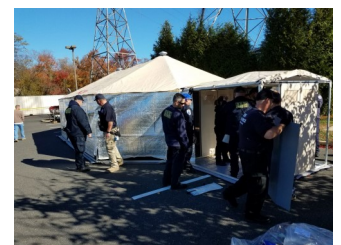
The Department deployed a negative pressure tent to provide surge capacity for symptomatic patients coming to CHEMED Health Center.

The Department responded to a request for support at the CHEMED Health Center in Lakewood to assist them with the influx of patients since the Ocean County measles outbreak was announced.